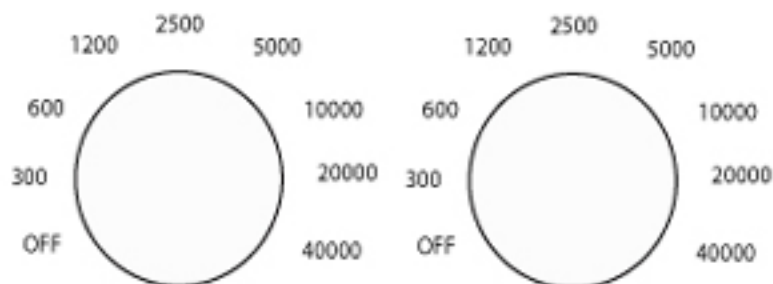
LOW CUTOFF C.P.S.